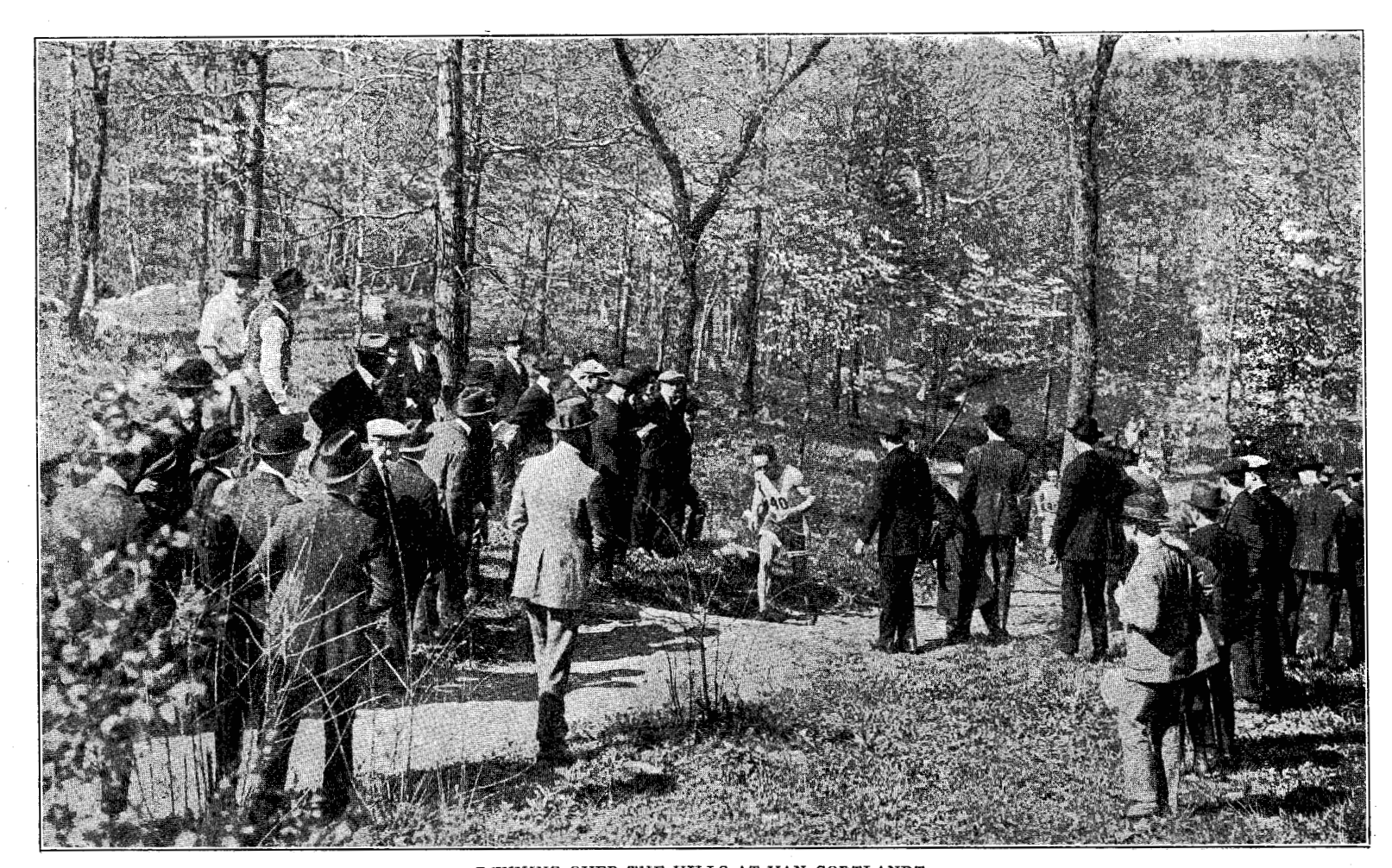
RUNNING OVER THE HILLS AT VAN CORTLANDT