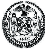
Michael R. Bloomberg Mayor

Reflecting the significance of the immigrant population to our City's economic, political and social life, in November 2001, voters adopted, by referendum, the Office of Immigrant Affairs into the New York City Charter. The Office ensures that immigrants have meaningful access to the City's services and its many agencies. The work of the Office of Immigrant Affairs is more challenging and critical than ever before. Nearly 40 percent of New Yorkers were born outside the United States, and nearly 50 percent speak a language other than English at home. I am personally committed to the full integration of this important segment of the City's population into all aspects of the City's civic, economic, and cultural life.