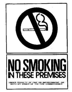
NO SMOKING SIGN

Motor fuels are flammable and easily ignited. For this reason no smoking is permitted anywhere on the premises. The penalty for smoking is a fine up to $500.00, and/or imprisonment for up to 6 months. This applies to customers as well as employees. Signs must be constructed of a durable metal and posted indicating that no smoking is permitted on the premises and must include procedures to be followed in case of a fire emergency.. There will be no servicing or repair of motor vehicles in areas used for dispensing. An example of a No Smoking sign is shown below: