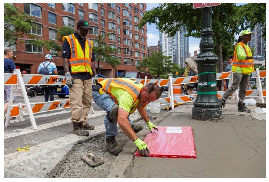
Accessible Pedestrian Signal and Pedestrian Ramp Installations