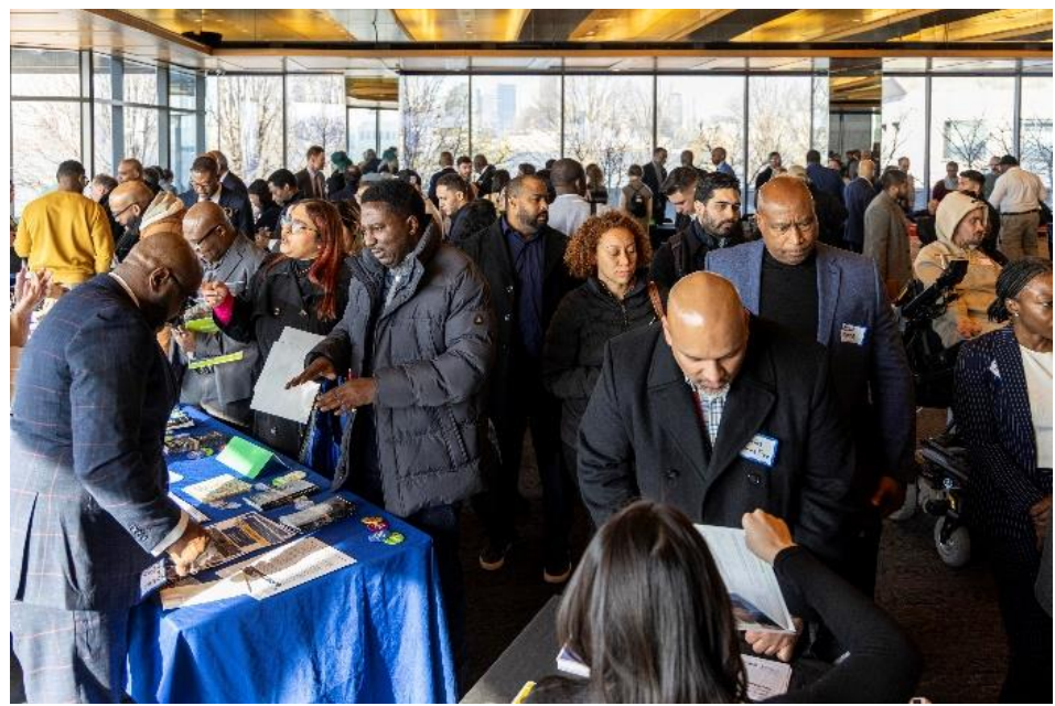
Doing Business with NYC DOT event in 2023