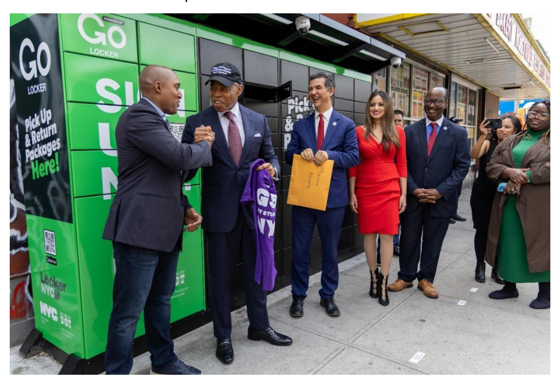
Mayor Eric Adams launches LockerNYC in Bed-Stuy, Brooklyn

Last month, DOT along with Mayor Eric Adams launched LockerNYC , a free pilot program that will allow New Yorkers to receive packages securely in lockers installed on sidewalks while consolidating deliveries at central locations to reduce delivery truck traffic. We also announced $6 million in new financial incentives in our Off Hour Delivery Program to encourage businesses to shift truck deliveries to the off-peak hours.