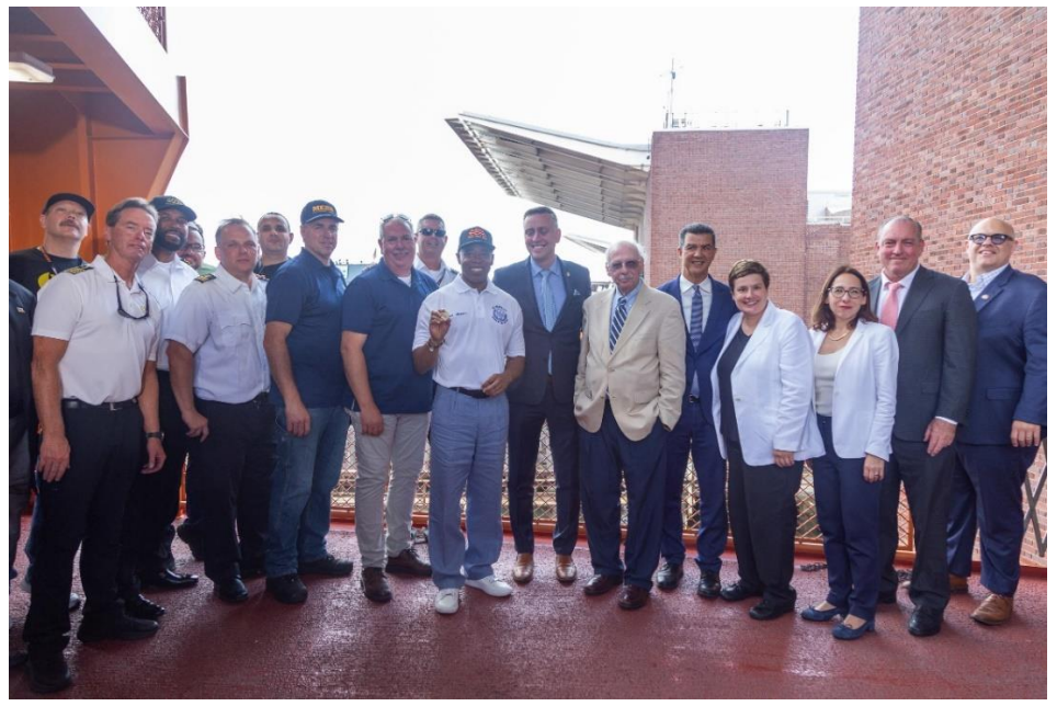
Above: the Dorothy Day, the newest Ollis-class ferry; Below: Staten Island Ferry Labor Agreement Announced by NYC Mayor Adams