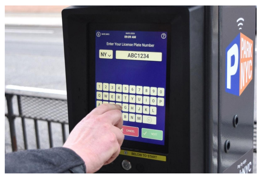
New Pay-by-Plate Parking Meter in Long Island City, Queens

And to take an important step in transforming the city's parking management system, today we are beginning to upgrade the City's 14,500 parking meters to the new Pay-by-Plate technology. This transition to a license plate-based system will improve parking enforcement and end the need to display a paper receipt on the vehicle dashboard.