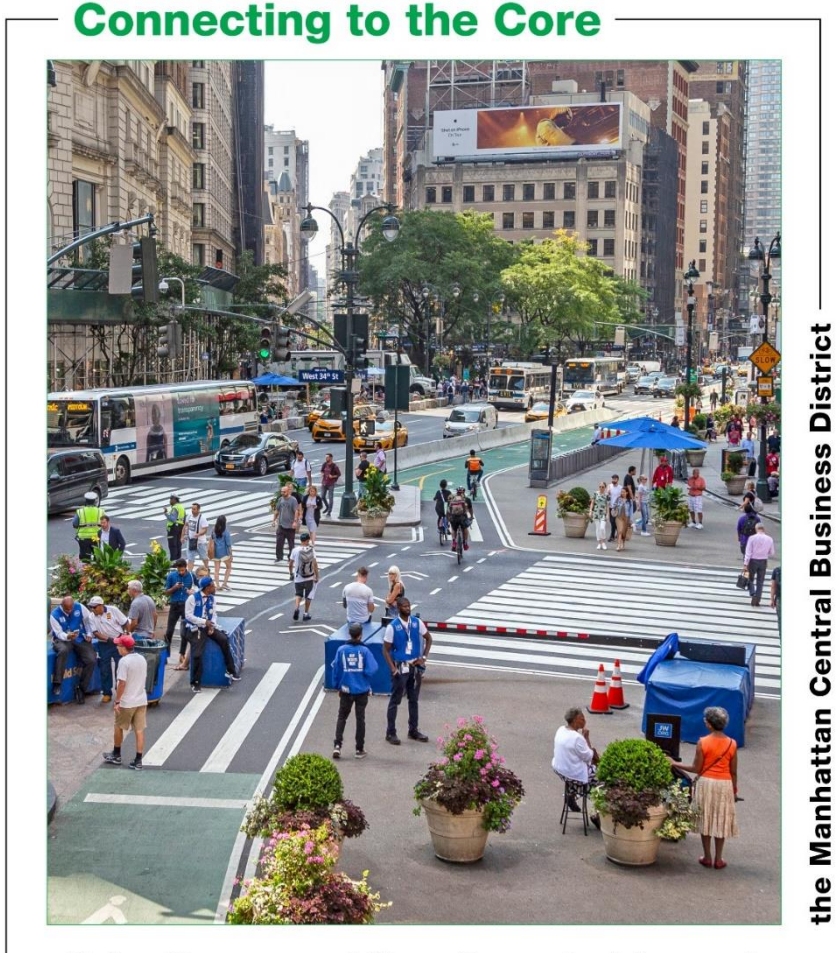
Safer, Greener, and More Convenient Access to

Last week, we released "Connecting to the Core," a plan highlighting existing and upcoming projects to support multi-modal transportation to the Manhattan CBD. The report highlights 47 bus, bike, and public realm projects that have been implemented since the authorizing state law for congestion pricing passed in 2019, and 37 new projects for which the agency plans to begin public engagement in the months ahead.