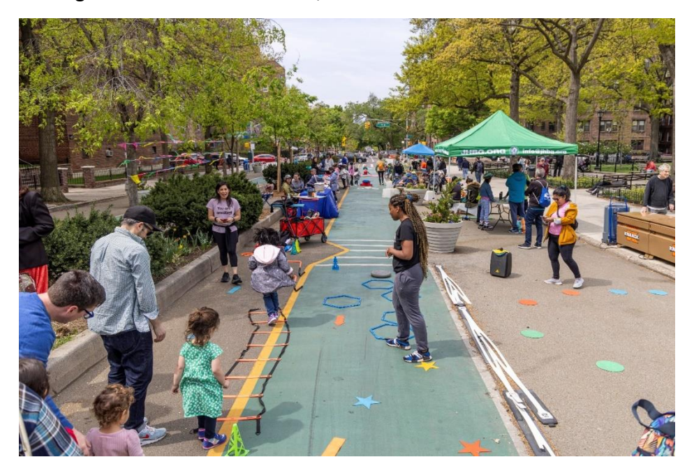
Open Street at 34<sup>th</sup> Avenue in Queens

Turning to the public realm, this Administration continues to reimagine the use of public space. Last month, DOT celebrated the largest Open Streets: Car Free Earth Day to date with 53 carfree streets and plazas throughout the five boroughs. This event, along with our Summer Streets Program, gives New Yorkers a taste of what an Open Street feels like and motivates them to work with our agency and community partners to create more Open Streets in their neighborhoods. The event also kicked off the start of the Open Streets season with 132 initial locations, including two dozen new locations, with more to come.