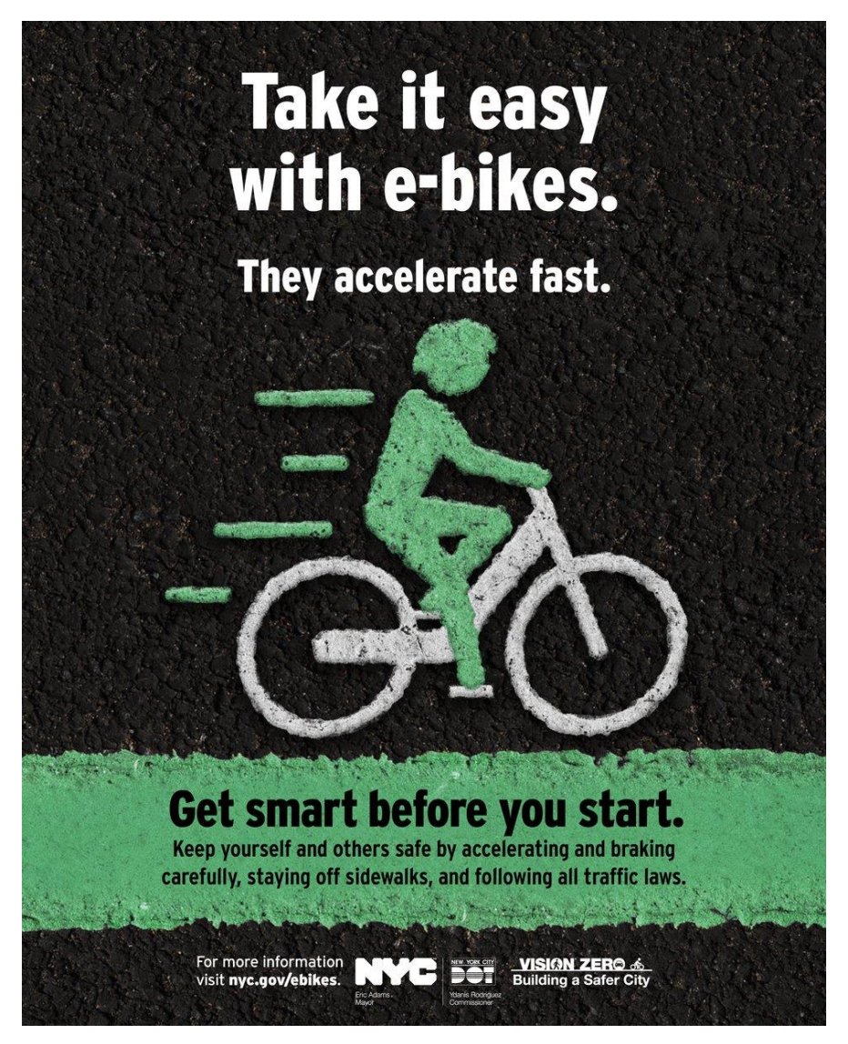
Get Smart Before You Start e-bike public education campaign

Beyond the focus on intersections, the Adams Administration is responding to these troubling trends in targeted ways. For example, to address rising e-bike fatalities and deadly single-bicycle crashes, we launched "Get Smart Before You Start," a new public education campaign to inform e-bike riders on how to properly accelerate, brake, and operate at an appropriate speed.