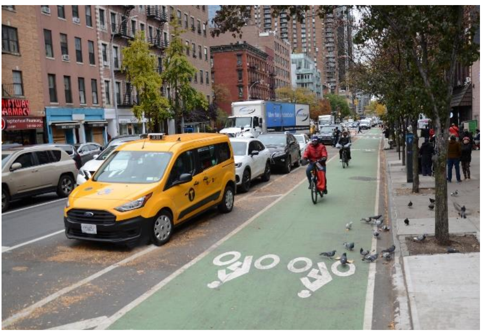
New double-wide Bike Lanes along Third and Tenth Avenues, Manhattan