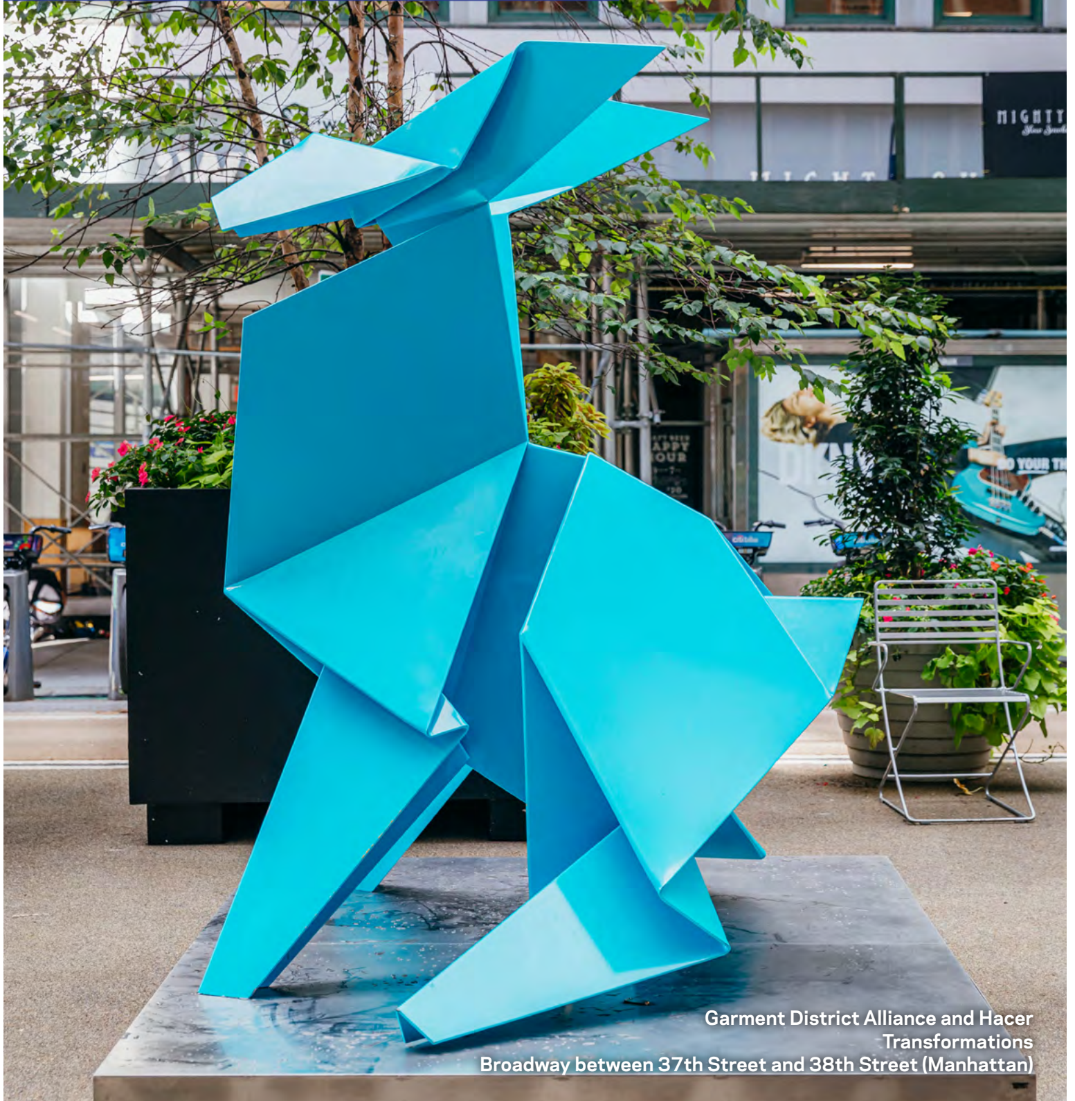
Garment District Alliance and Hacer Transformations Broadway between 37th Street and 38th Street (Manhattan)