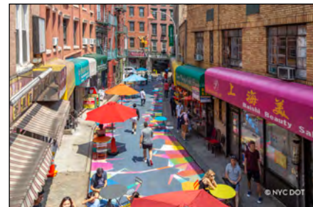
Asphalt Pedestrian Space Dan Monteavaro (Moncho1929)