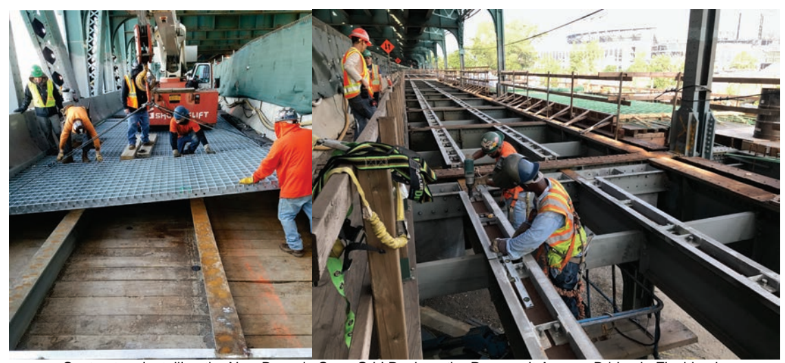
Contractors Installing the New Bascule Span Grid Deck on the Roosevelt Avenue Bridge in Flushing in March 2017. The Bridge is Permanently Set in a Closed Position Since the Late 1950's. Installing Haunch Angles at the West Viaduct Roadway Deck in July 2017.