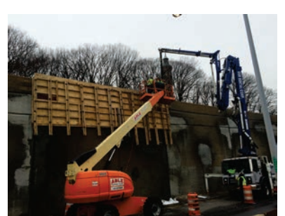
Trans-Manhattan Connector Ramp Under Construction in January 2017.

NYCDOT has two bridges rated "poor." The Harlem River Drive Ramp to the George Washington Bridge over the Harlem River Drive Southbound (aka the Trans-Manhattan Connector Ramp) is not really poor, as we reached substantial completion of a reconstruction project on May 15, 2017. The 51st Avenue Pedestrian Bridge over LIRR Main Line is scheduled by DDC to start being replaced by a new bridge in Fiscal Year 2019.