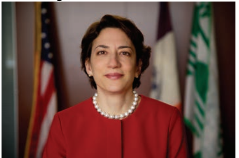
A Message from the Commissioner