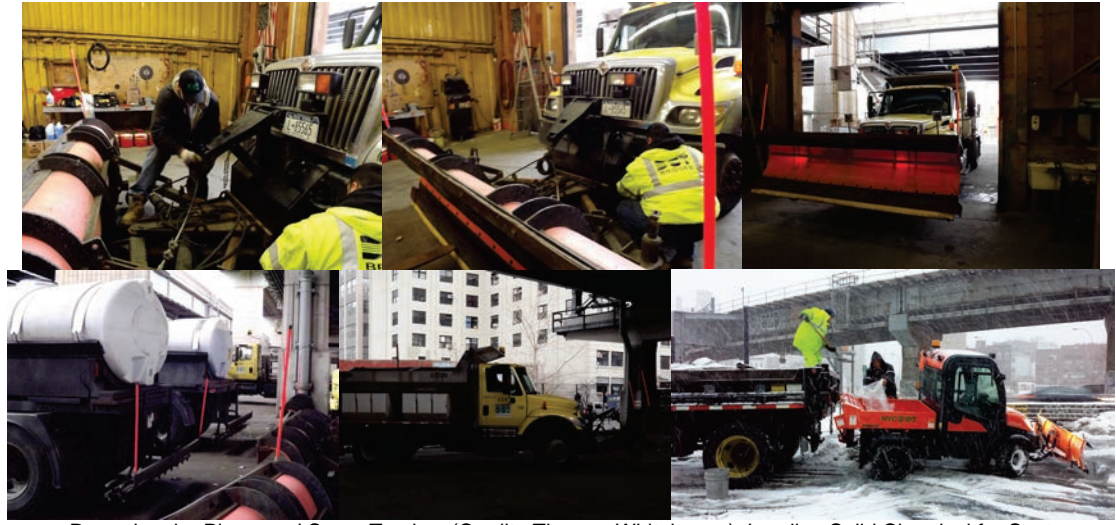
Preparing the Plows and Spray Trucks. Loading Solid Chemical for Spot Applications on the Williamsburg Bridge Walkway/Bicycle Path.

In the winter of 2016 - 2017, a total of 19,448 gallons of potassium acetate and 157 tons of sodium acetate were applied on the roadways of all four East River Bridges.