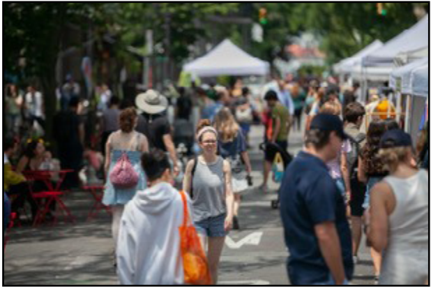
Montague Open Street, Brooklyn Montague Street Business Improvement District