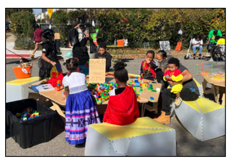
Trick or Streets

For the 2nd annual Trick or Streets, NYC DOT and its partners produced 115+ events on Open Streets and Plazas citywide. We distributed over 1,000lbs of candy and in partnership with The Hort, gave away 1,500+ pumpkins and squash.