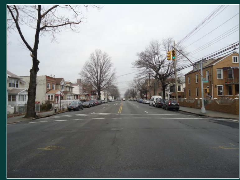
229th St and Bronxwood Ave, looking north