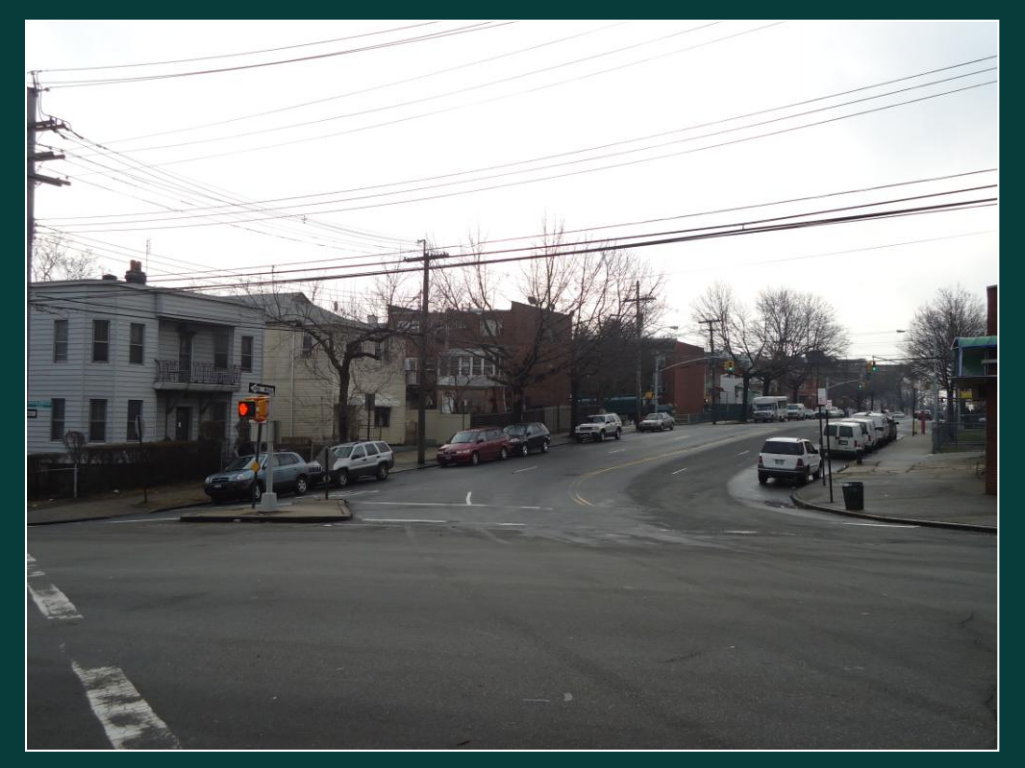
233rd St and Bronxwood Ave, looking south