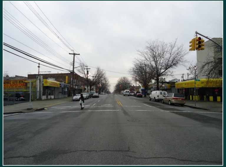
225th St and Bronxwood Ave, looking south