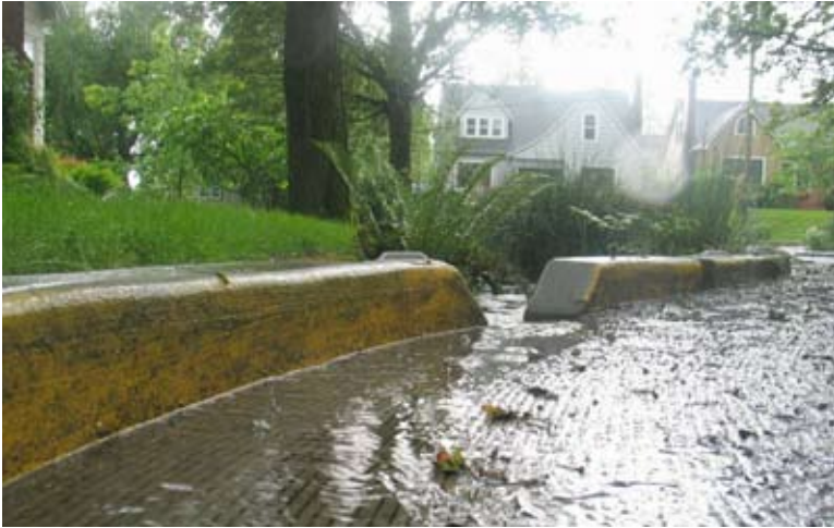
Simple design features like cut-outs allow water to flow off the pavement and into porous areas thus reducing flooding.

In Seattle and Portland, planners have removed or altered existing curbs to reduce water run-off after storms. Typically, curbs tend to channelize water resulting in high velocities and high content of sediment and pollution. Removing short sections of the existing curb allows water to be strategically distributed over large vegetated areas or directed into natural infiltration and retention systems.