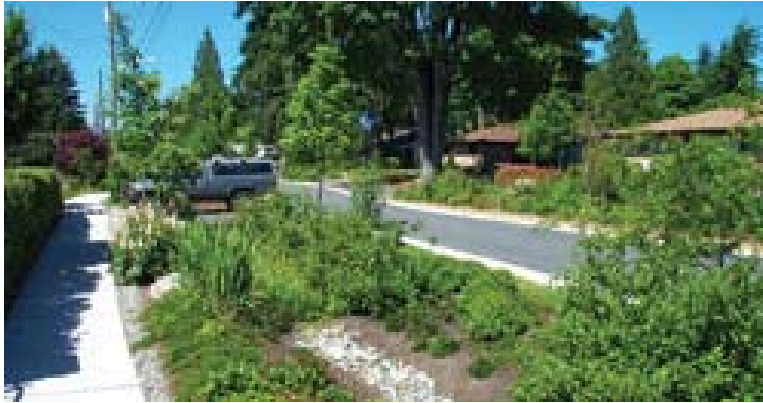
Bioswales in Seattle reduce street flooding.

The primary objective of a vegetated swale is the short term retention of large volumes of stormwater. In suburban or rural areas, a vegetated swale is often an existing ditch or depression that has been modified into a chain of small ponds and planted with native species. In vegetated swale designs, rain run-off is allowed to accumulate in large volumes. In the days following a storm, water is slowly removed through the combination of infiltration into the ground, plant uptake, and evaporation. Swales can retain large volumes of stormwater and provide excellent pollution removal.